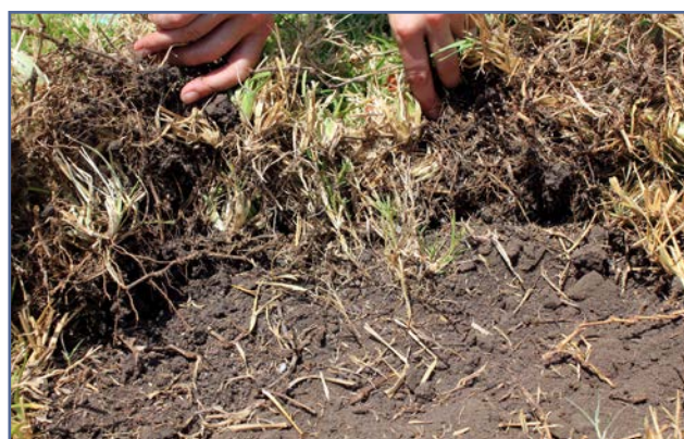
Figure 4. White grub damage to turfgrass roots.

lawns, or athletic facilities adjacent to wooded areas. As with many insect pests, prevention is a critical component of effective white grub management.