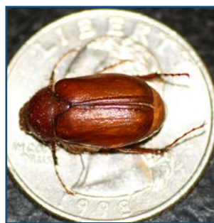
Figure 2. Phyllophaga crinita adult beetle.