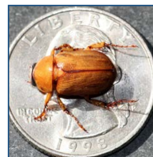
Figure 3. Southern masked chafer ( Cyclocephala lurida ) adult beetle.