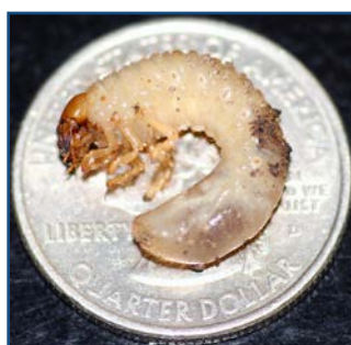
Figure 1. May/June beetle 3rd instar white grub.

W hite grubs (Fig. 1) are the larval stage of scarab beetles, also known as May/June beetles or chafers. There are over 100 species of May/June beetles in Texas, but only a few species cause damage to turfgrass. Those species include May/June beetles, Phyllophaga crinita and Phyllophaga congrua , as well as the southern masked chafer, Cyclocephala lurida (Figs. 2 and 3). White grubs feed on the roots and other belowground portions of warm-season turfgrasses, such as bermudagrass, zoysiagrass, buffalograss, and St. Augustinegrass. They also feed on cool-season turfgrasses such as fescues, bluegrasses, and ryegrasses. Visible damage includes irregularly shaped patches of dead turfgrass that may resemble symptoms of drought stress. In severe cases, damaged turfgrass can often be rolled up like a carpet (Fig. 4). Secondary damage may also occur when skunks, raccoons, and armadillos dig through the turfgrass in search of grubs to eat. Such damage may be particularly severe on golf courses, home