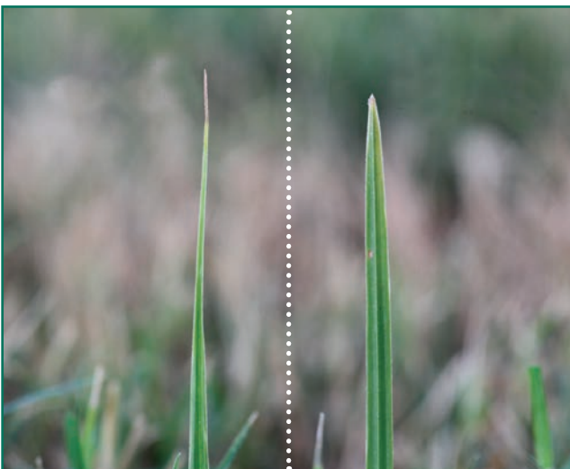
Figure 4. Yellow nutsedge leaf tips (left) gradually taper to a fine point, while purple nutsedge leaf tips (right) end more abruptly in a blunt tip.

Annual sedge (Fig. 6) has spikelets on the seedheads that are much more flattened than pur-