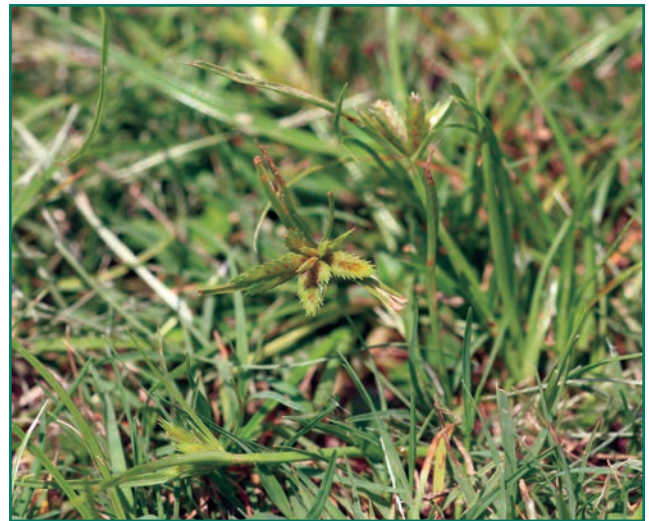
Figure 6. Annual sedge can be identified by its flat seedhead and lack of rhizomes or tubers.

Sedges often indicate chronically excessive soil moisture, which should always be addressed as part of an overall treatment program. Yellow nutsedge is generally easier to control than purple