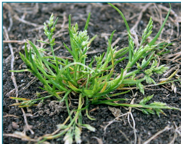
Figure 2. Annual bluegrass clump and inflorescence

Heavy reliance on herbicides to control annual bluegrass increases the likelihood that it will develop herbicide resistance. This is especially true if you routinely use only a single herbicidal mode of action.