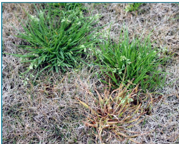
Figure 3. Annual bluegrass plants that appear to be resistant to ALS-inhibitors (Revolver, Monument, etc.) The plant showing injury is susceptible while the two noninjured plants appear to be resistant.

displaying herbicide injury symptoms among unaffected plants is an indicator that plants may be herbicide resistant (Fig. 3). However, before assuming that weed survival (escapes) are due to resistance, remember that herbicide applications can also fail due to growth stage, application rate, uniformity, coverage, timing, temperature, etc.