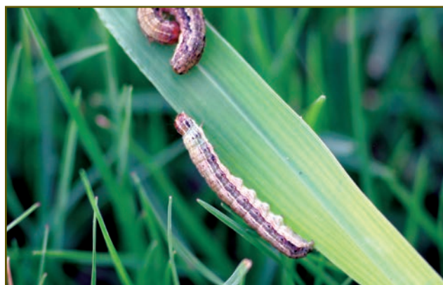
Figure 1. Fall armyworm larvae.