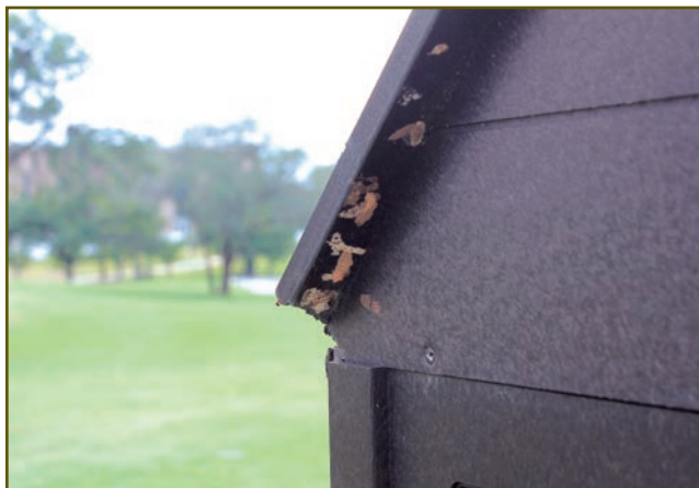
Figure 5. Fall armyworm eggs laid on a golf course water cooler.

Damage by fall armyworm caterpillars (larvae) initially appears at the tips of the grass blades. The tips look transparent due to the plant cells being eaten. If left uncontrolled, caterpillars may continue feeding, stripping tissue from turfgrass leaves, and leaving brown areas adjacent to green turf.