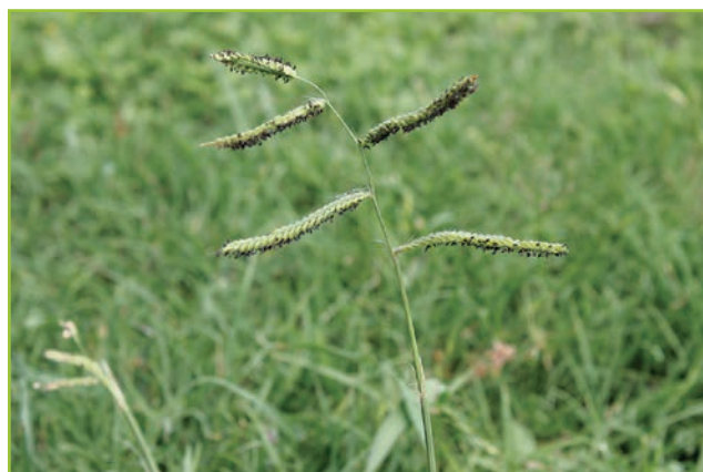
Figure 2. Characteristic drooping dallisgrass seedhead.

Dallisgrass grows rapidly and produces seedheads from late May through October. Other identifying features include a membranous ligule and prominent midrib (Fig. 3), which help distinguish it from other bunch-type weeds such as crabgrass ( Digitaria spp.). Unlike most bunch-type grasses, dallisgrass produces short rhizomes that increase the diameter of the plant and store carbohydrates (Fig. 4). These reserve carbohydrates make it difficult to control, even with systemic herbicides. Controlling dallisgrass with herbicides often requires multiple applications over several seasons.