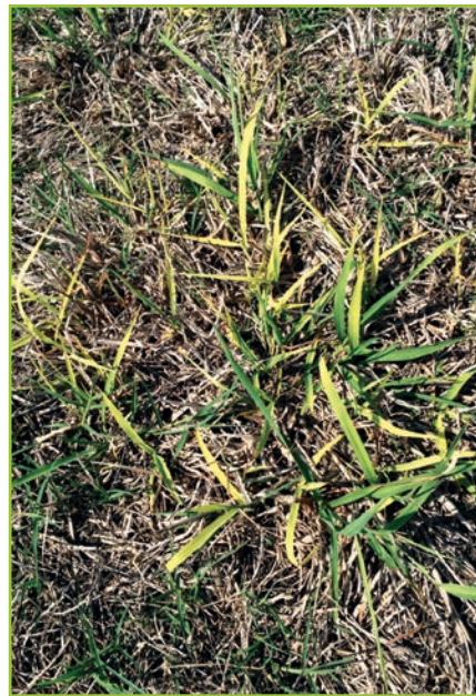
Figure 5. Dallisgrass regrowth in the spring following two applications of a sulfonylurea herbicide the previous fall. This photo shows symptoms of previous applications, but also has sufficient regrowth for a third application. At least three applications are necessary for control of larger plants.

Make your first herbicide application in the fall (not before September) when the average 24-hour air temperature falls below 72°F for at least three consecutive days. In a typical year, this might occur from mid to late September in the Panhandle and North Texas. This average temperature can occur as late as October in Central and South Texas. Make the second application 4 to 6 weeks later when dallisgrass begins to regrow. Making a third application in the spring when dallisgrass begins to regrow (mid to late April) provides better control than two fall applications alone (Fig. 5).