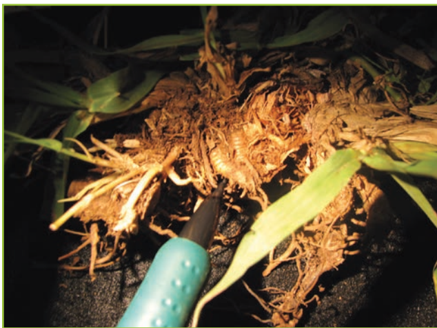
Figure 4. Dallisgrass contains short rhizomes, making control from herbicides and hand removal difficult.

Regardless of the post-emergent herbicide you select, it is important to apply it at the right time. Research shows that applying herbicides in early to late fall, while dallisgrass is still actively growing, provides better control than applications made during late spring or summer. Complete control generally requires multiple applications—especially for larger plants. Currently, at least three sequential post-emergence herbicide applications are recommended. Pre-emergent herbicides will not control existing perennial plants.