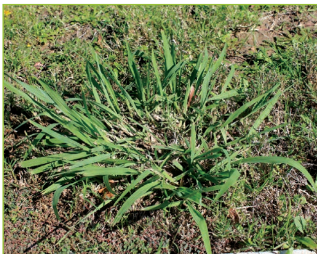
Figure 1. Dallisgrass growth habit in turf.

D allisgrass ( Paspalum dilatatum Poir.) is a warm-season perennial grass native to South America that was introduced to the United States in the late 1800s. It is one of the most problematic weeds of turfgrass in the southern and southeastern United States—it grows in bunches, has a coarse texture, and produces unsightly seedheads (Figs. 1 and 2). It can adapt to low mowing heights and proliferate in managed turfgrass. Its rhizomes make it difficult to remove using physical methods and even to control with herbicides.