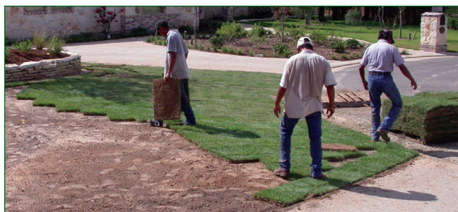
Figure 4. Sod installation.

Sodding. The firm soil surface should be free of footprints, stones, depressions and mounds. Sod is perishable and should be installed within 36 hours of harvest. If you see mildew or yellow grass leaves as you pull the pieces off the pallet, it is evidence of “sod heating” injury, which happens when sod is left on the pallet too long. Do not plant such sod.