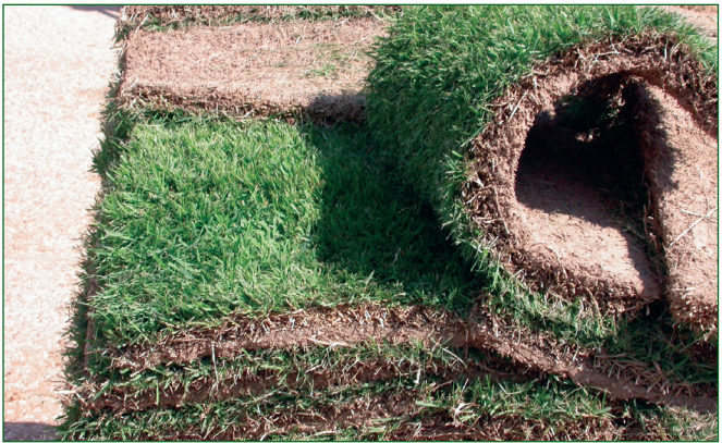
Figure 2. Sod pieces stacked on a pallet awaiting installation.

Sod has traditionally been sold by the square yard, though the trend now is to sell it by the square foot. To determine the amount of sod you will need, measure the square feet of the area to be planted, then divide the total square feet by 9 (the number of square feet in a square yard) to calculate square yards. There are 111 square yards per 1,000 square